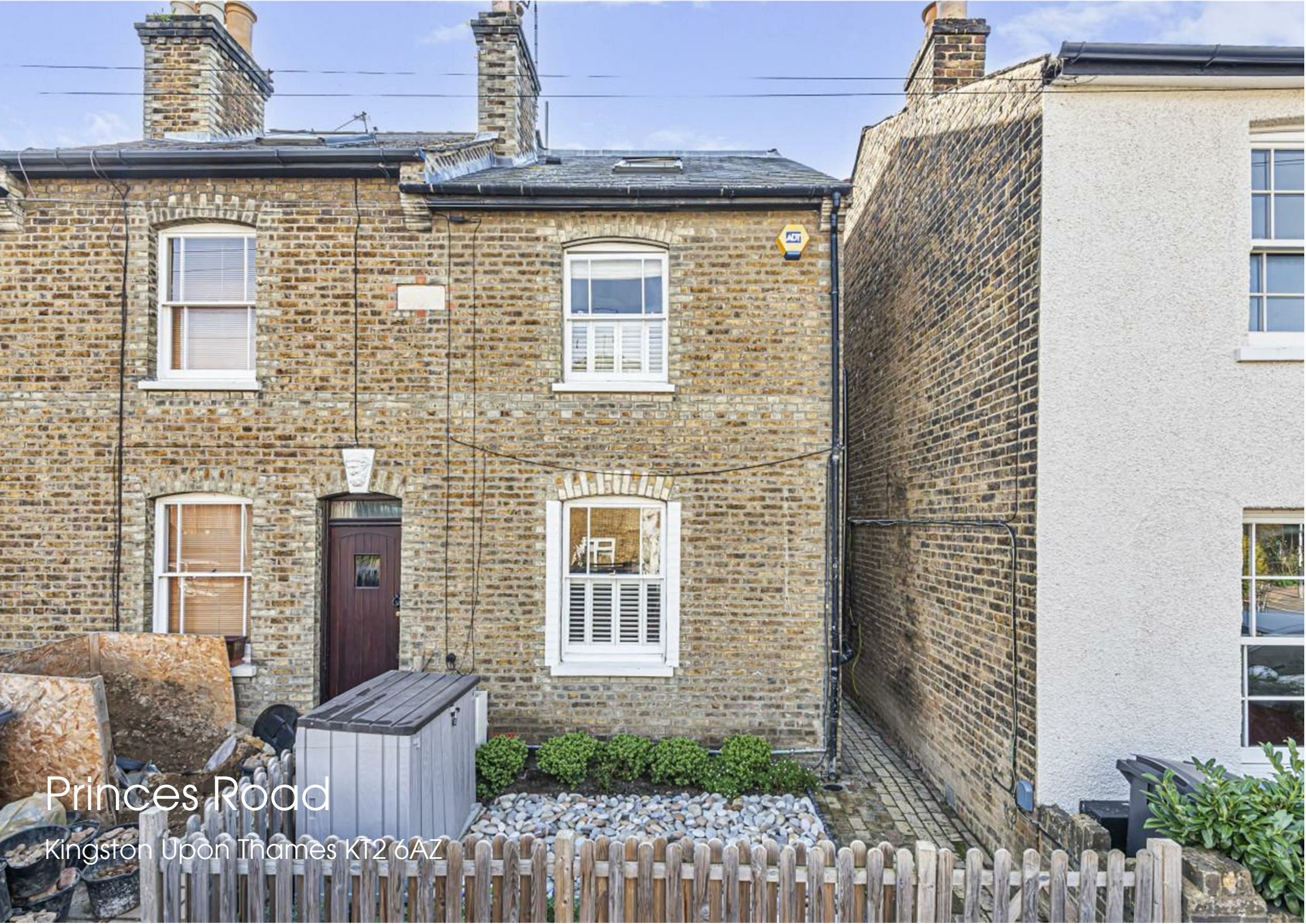
Princes Road Kingston upon Thames KT2 6AZ